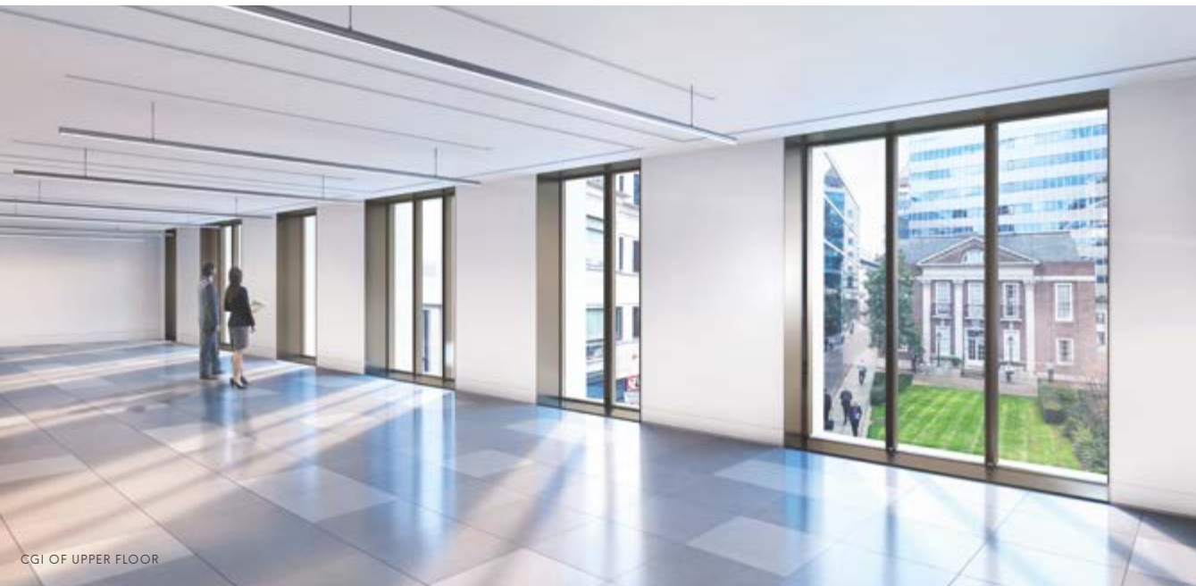
CGI OF UPPER FLOOR

The above net internal areas are estimated only & are to be verified upon completion. IPMS 3 areas available upon request.